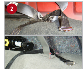
Photo shows two models of seat belt brackets, straps should loop through.